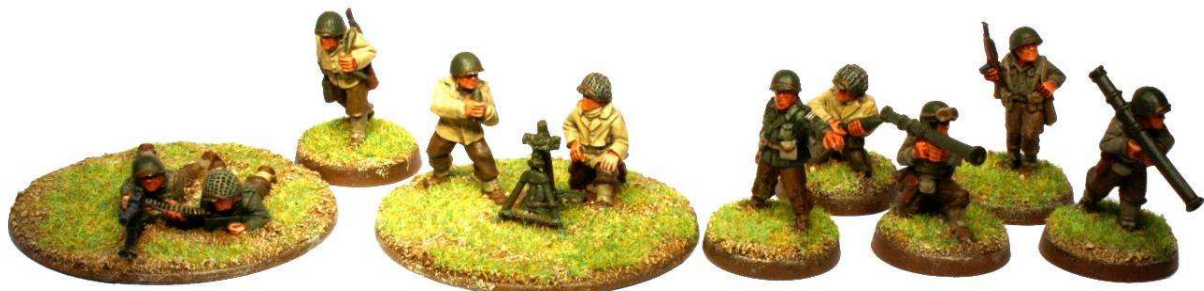
Artizan figures painted by Mick Farnworth