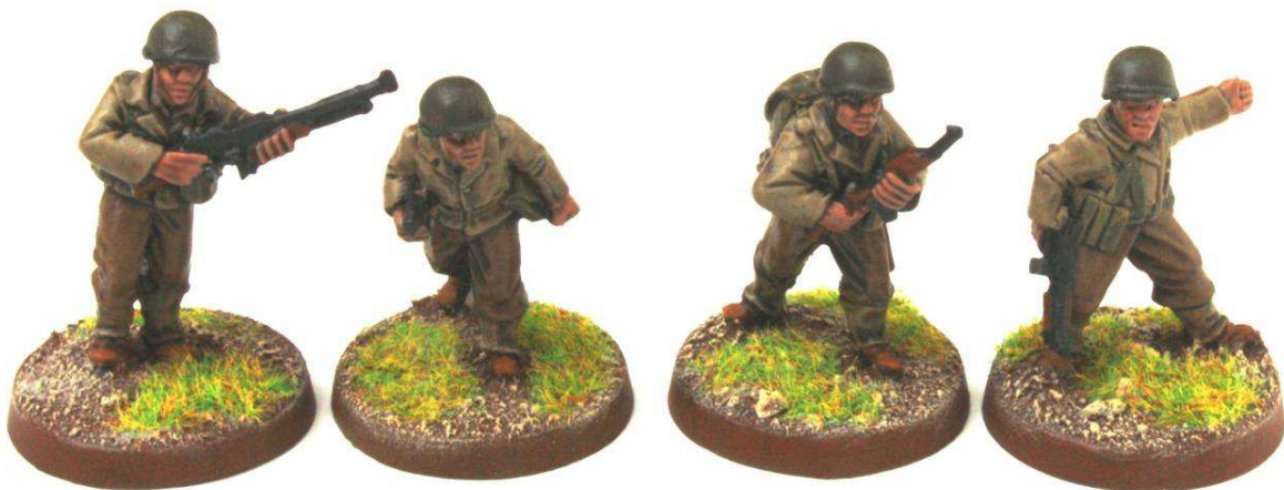
Crusader figures painted by Mick Farnworth